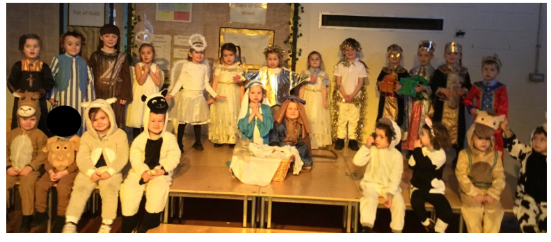
We hope you enjoyed the performance and the Christmas Craft afterwards!

They performed brilliantly, with such confidence and enjoyment—thank you to the children and staff for bringing Christmas joy to all who came to watch.