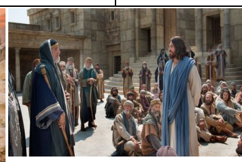
The greatest Commandment