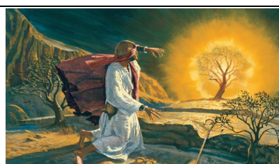
Moses and the burning bush