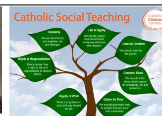
Catholic Social Teaching