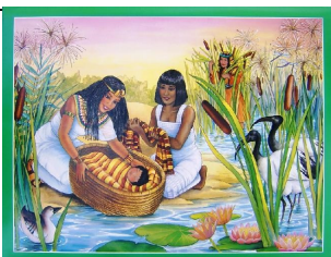
Moses in a basket