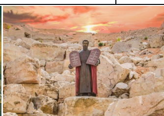
The Ten Commandments