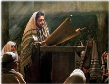
Jesus is rejected at Nazareth