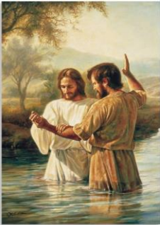
Jesus is Baptised by John the Baptist

The Holy Spirit appears under different names and signs through scripture such as; fire, wind, a dove.