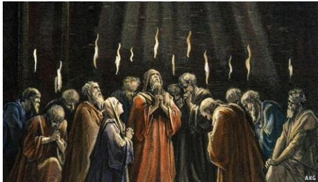
Pentecost (the coming of the Holy Spirit)