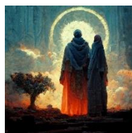
Abraham and Sarah (Isaac)