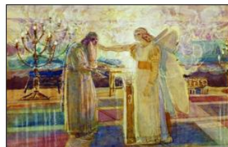
Annunciation of Zechariah (John the Baptist)