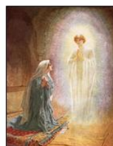
Annunciation of Mary (Jesus)