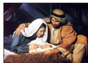
The birth of Jesus