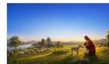
Parable of the Lost Sheep - Jesus' teachings about God.