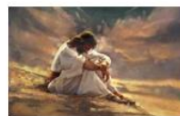
Temptation in the wilderness