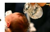
Sacrament of Baptism