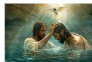
Baptism of Jesus