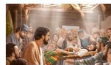
Cure of a paralytic - Jesus' miracles