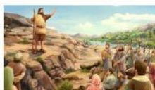
Preaching of John the Baptist