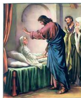
Jesus healing Peter's mother-in- law