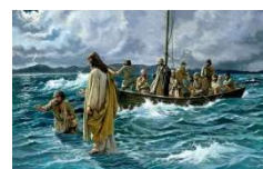
Jesus walks on water