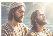
The Baptist's Question