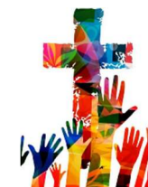
Catholic Social Teaching