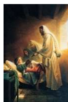
The official's daughter raised to life