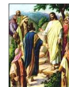
Peter's profession of faith