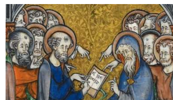
The Apostles' Creed