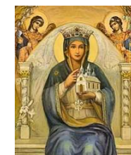
Mother of the Church