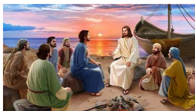
(John 21: 1-19)