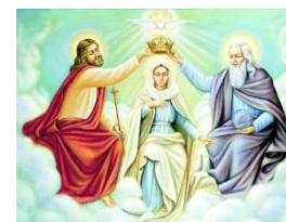
The Queen of Heaven