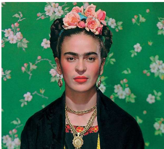
Key Artist: Frida Kahlo

Line Sketch Shape Pattern Composition Scale Surrealism Perspective Proportion Focal point